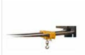
FORK HOOK 1000 DHE.MK10