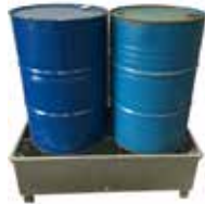
SPILL CONTAINER SCB2 DHE.SCB2