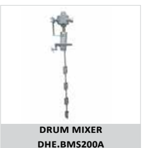
DRUM MIXER DHE.BMS200A