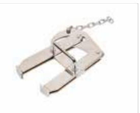
CAMMED ACTION PALLET PULLER DHE.PU30