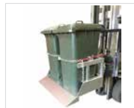
BIN LIFT TIPPER DOUBLE DHE.BLTD