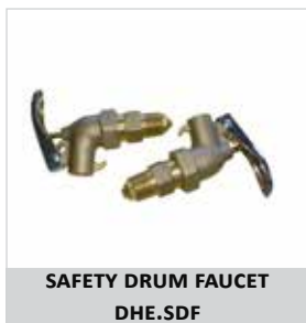
SAFETY DRUM FAUCET DHE.SDF