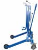
DRUM TRANSPORTER DHE.DTR250