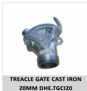
TREACLE GATE CAST IRON 20MM DHE.TGCI20