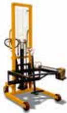
TILTING DRUM UNIT DHE.TB35