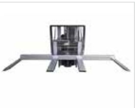
FORK SPREADER DHE.FS2.5