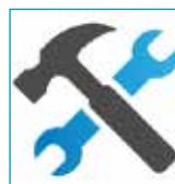
Accessories & Tools