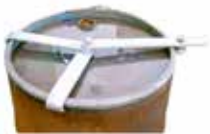
DRUM CLOSING TOOL DHE.DST200