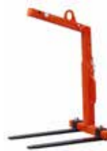
CRANE PALLET LIFTER 1 TONNE SELF LEVEL DHE.PLCY1