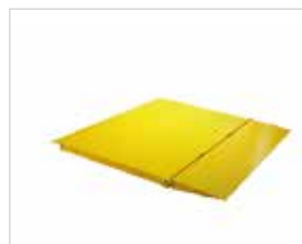
CONTAINER RAMP STD DUTY 6.5 TONNE DHE.FR6.5