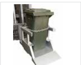
BIN LIFT TIPPER SINGLE DHE.BLTS