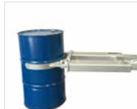
SINGLE DRUM LIFTING CLAMP DHE.DH1