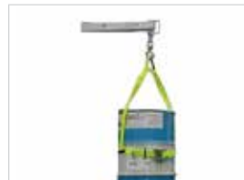
WEBBING SLING 400KGS