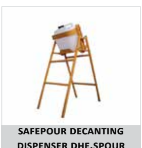
SAFEPOUR DECANTING DISPENSER DHE.SPOUR