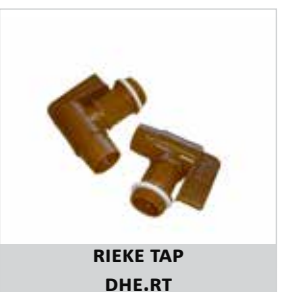
RIEKE TAP DHE.RT