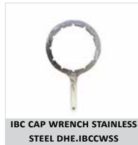
IBC CAP WRENCH STAINLESS STEEL DHE.IBCCWSS