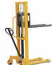
HAND STACKER DHE.HS15