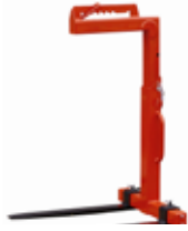
CRANE PALLET LIFTER 1 TONNE DHE.PLCK1