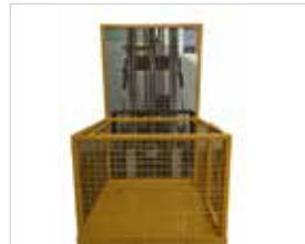
FORKLIFT SAFETY CAGE DHE.FSCB