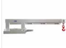
RIGID JIB 2.5 TON LONG DHE.RJL2.5