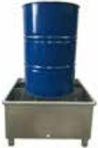
SPILL CONTAINER SCB1 DHE.SCB1