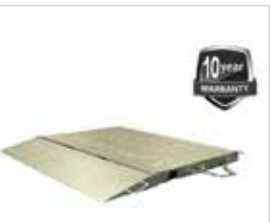
CONTAINER RAMP HEAVY DUTY 8 TONNE DHE.FR8