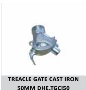
TREACLE GATE CAST IRON 50MM DHE.TGCI50