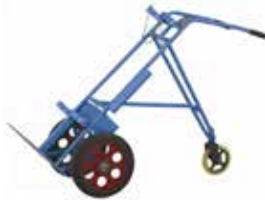
GAS CYLINDER TROLLEY DHE.AC20B