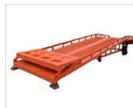
STANDARD DUTY DOCKING RAMP 8 TONNE DHE.FSDR8