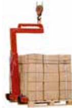
CRANE PALLET LIFTER 2 TONNE DHE.PLCK2