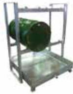
4 DRUM STORAGE RACK & BUND DHE.DSR4