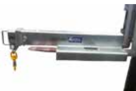
LOW PROFILE JIB SHORT DHE.ERJS4.5