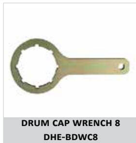
DRUM CAP WRENCH 8 DHE-BDWC8