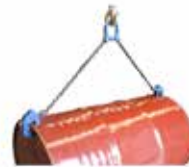
DRUM LIFTER CHAIN SLING DHE.DL500CH