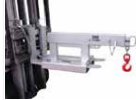
RIGID JIB 4.75 TON SHORT DHE.RJS4.75