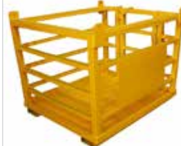
CRANE CAGE DHE.CC2P