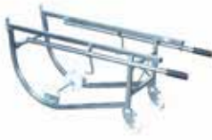
TILTING DRUM STAND DHE.TDS