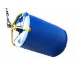
DRUM GRAB DHE.DG15