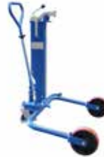
HYDRAULIC DRUM TRANSPORTER DHE.DT250