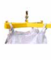
BULK BAG CARRIER CRANE ATTACHMENT DHE.BBCCA1