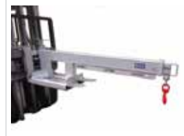
RIGID JIB 4.75 TON LONG DHE.RJL4.75