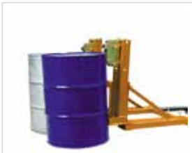
GATOR GRIP TWIN DRUM GRAB DHE.GGTDG