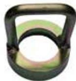
DRUM BUNG WRENCH DHE.BDWL