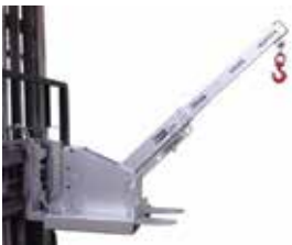
INCLINE JIB 2.5 TON SHORT DHE.IJS2.5