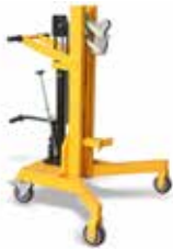
RAPTOR DRUM TROLLEY DHE.DTF450