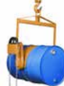
GEARED TYPE DRUM LIFTER DHE.LG800