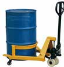
HYDRAULIC DRUM TRUCK DHE.HJ365