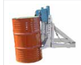
GRAB O Matic SINGLE DRUM LIFTER DHE.GOM1