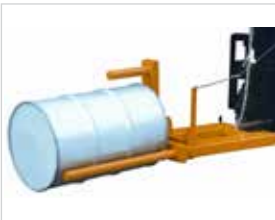
DRUM POSITIONER DHE.DR400