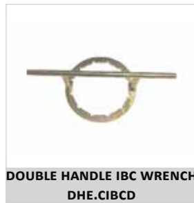
DOUBLE HANDLE IBC WRENCH DHE.CIBCW