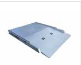
CONTAINER RAMP LONG 8 TONNE DHE.FRL8