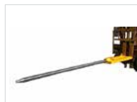
CARPET POLE SLIP ON