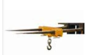
FORK HOOK 2500 DHE.MK25