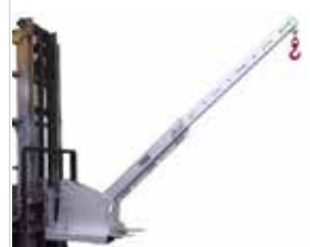
INCLINE JIB 4.75 TON LONG DHE.IJL4.75