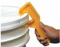
PAIL OPENER DHE.PO