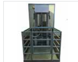
FORKLIFT SAFETY CAGE DHE.FSCW