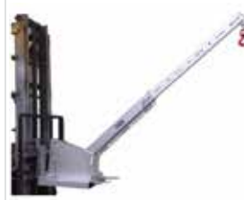
INCLINE JIB 2.5 TON LONG DHE.IJL2.5