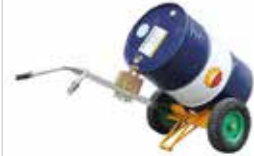
DRUM TRUCK DHE.DE450