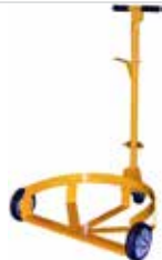
LOW PROFILE DRUM CADDY DHE.DC500