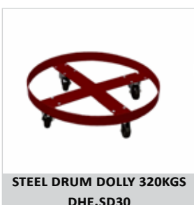
STEEL DRUM DOLLY 320KGS DHE.SD30