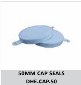
50MM CAP SEALS DHE.CAP.50