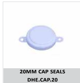
20MM CAP SEALS DHE.CAP.20