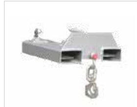
TYNE HOOK DHE.TH24P