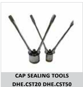
CAP SEALING TOOLS DHE.CST20 DHE.CST50