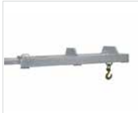
SLIP ON JIB DHE.LJ2T