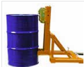
GATOR GRIP SINGLE DRUM GRAB DHE.GGSDG