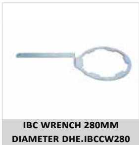
IBC WRENCH 280MM DIAMETER DHE.IBCCW280