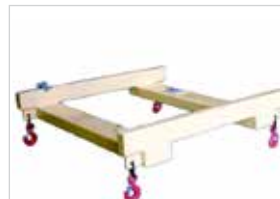
BULK BAG CARRIER FORKLIFT ATTACHMENT DHE.BBCSL1