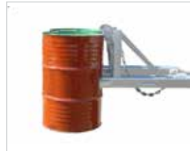
PARROT BEAK TWIN DRUM LIFTER DHE.PB02