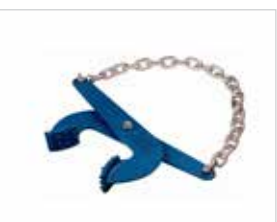
PALLET PULLER SINGLE SCISSOR ACTION DHE.PU20