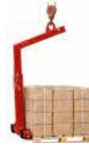
CRANE PALLET LIFTER 2 TONNE SELF LEVEL DHE.PLCY2