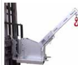
INCLINE JIB 4.75 TON SHORT DHE.IJS4.75