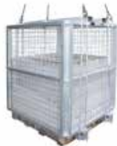
BRICK CAGE DHE.CBC6