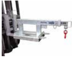
RIGID JIB 2.5 TON SHORT DHE.RJS2.5