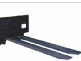
FORKLIFT SLIPPERS CLASS 1 TO CLASS 7