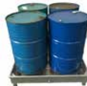
SPILL CONTAINER SCB4 DHE.SCB4