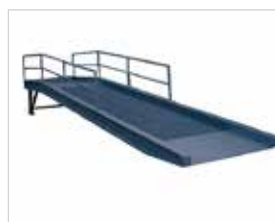
HEAVY DUTY DOCKING RAMP 10 TONNE DHE.FSCR10