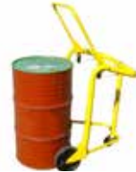
4T4 EZE DRUM TROLLEY DHE.4T4EZE