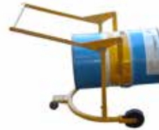
DRUM CARRIER DHE.HD80A