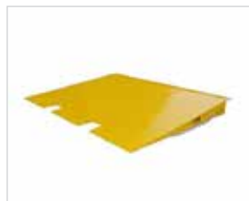
CONTAINER RAMP STD DUTY 7 TONNE DHE.FRSD7