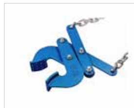
PALLET PULLER DOUBLE SCISSOR ACTION DHE.PU10