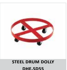
STEEL DRUM DOLLY DHE.SD55