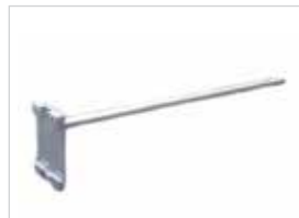
CARPET POLE CARRIAGE MOUNT