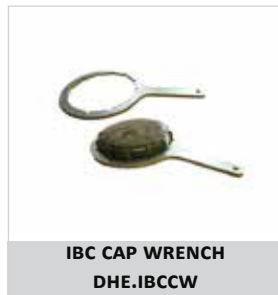
IBC CAP WRENCH DHE.IBCCW