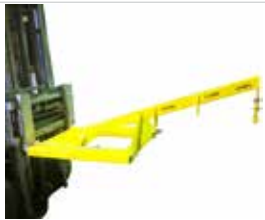
FORKLIFT JIB CRANE DHE.1100