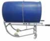
TILTING DRUM STAND SP DHE.TDSSP