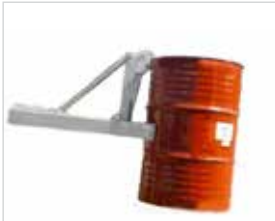
PARROT BEAK SINGLE DRUM LIFTER DHE.PB01