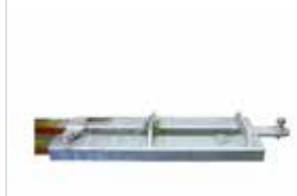
TOW UNIT 2 TONNE DHE.TW2T