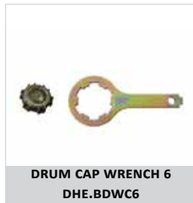
DRUM CAP WRENCH 6 DHE.BDWC6