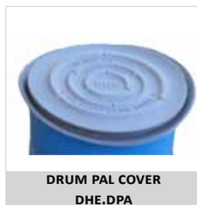
DRUM PAL COVER DHE.DPA