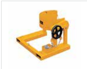
FORKLIFT DRUM ROTATOR DHE.DRI