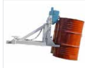
GRAB O Matic TWIN DRUM LIFTER DHE.GOM2