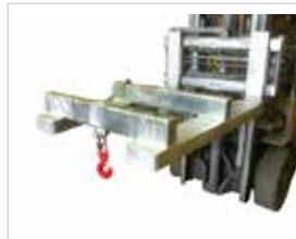
LIFTING JIB WIDE 2.5T DHE.WLJ2.5