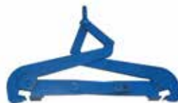
VERTICAL DRUM TONG DHE.VDT