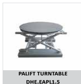
PALIFT TURNTABLE DHE.EAPL1.5