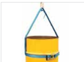
WEBBING SLING 500KGS