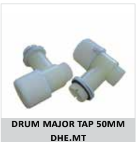
DRUM MAJOR TAP 50MM DHE.MT