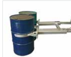
DOUBLE DRUM LIFTING CLAMP DHE.DH2