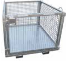
CRANE GOODS CAGE DHE.CGC1